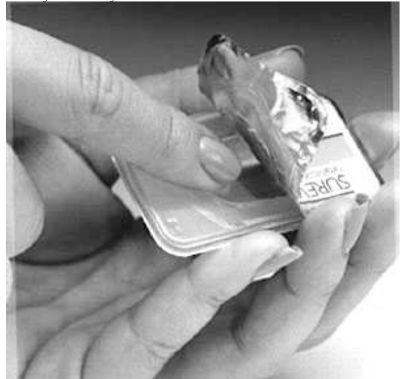
Note: Always start with the lens for your right eye. Making this a habit will help ensure that you always place the correct lens on the correct eye.

Occasionally, a lens may adhere to the inside surface of the foil when opened, or to the plastic package itself. This will not affect the sterility of the lens. It is still perfectly safe to use. Carefully remove and inspect the lens following the handling instructions.